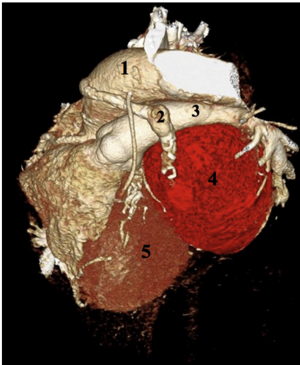
FIGURE 1 3-Dimensional Computed Tomography

1 = aorta; 2 = saphenous vein graft; 3 = pulmonary artery; 4 = saphenous vein graft aneurysm; 5 = left ventricle (Online Videos 1, 2 and 3).